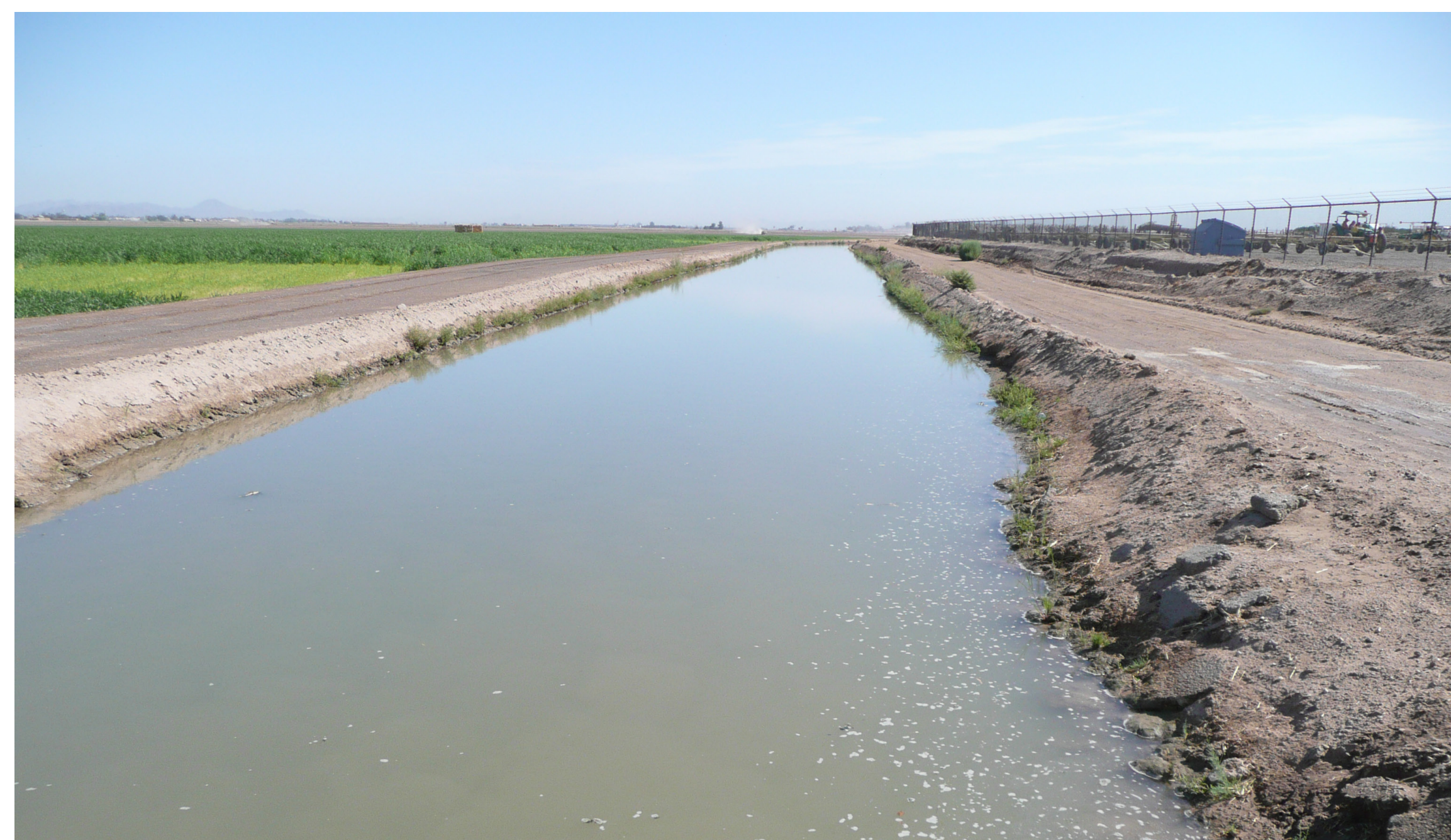
Figure 3. Irrigation canal in Arizona