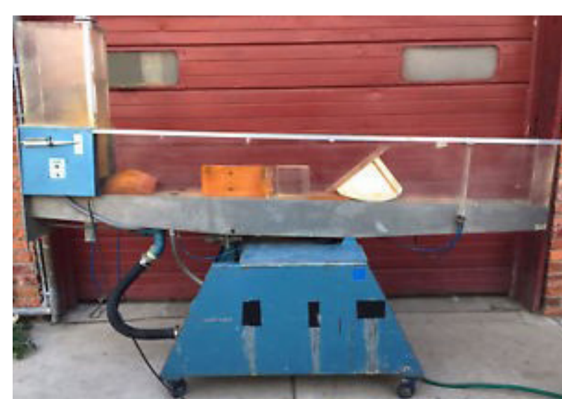
Figure 1. Hydraulic flume

Experiments are currently being conducted with a hydraulic flume comparing the impact of flow rate, velocity, and sediment type on the resuspension of MS-2 and phiX-174 viruses. These experiments will be completed by the middle of June and incorporated into a predictive model.